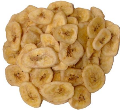
Figure 1: Banana chips.

There are two different methods for making banana chips. One of these is to deep fry thin slices of banana in hot oil, in the same way as potato chips or crisps. The other is to dry slices of banana, either in the sun or using a solar or artificial dryer. The products made by the two methods are quite different. The deep fried chips tend to be a savoury, high calorie product that is eaten as a snack food. Because they are deep fried in oil they have a fairly short shelf life- up to 2 months maximum when stored in the correct conditions. The oil is prone to turning rancid and the crisps to becoming soft if they are not stored in air-tight containers.